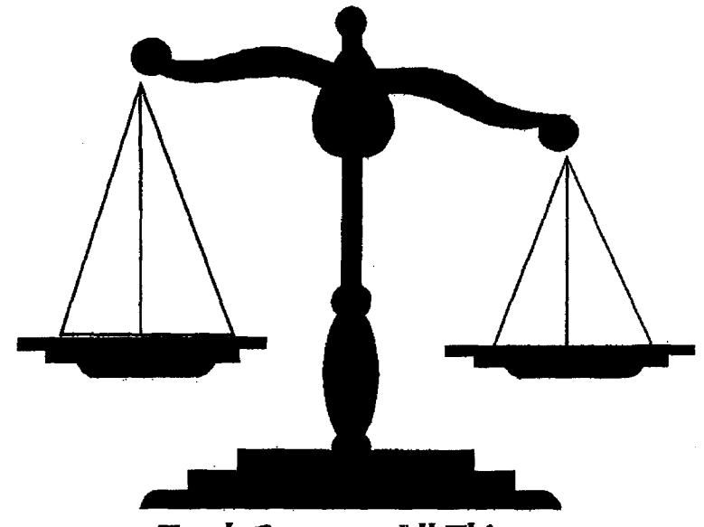
Truth Conquers All Things